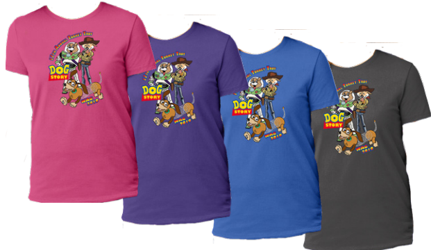
Ladies Short Sleeve Solid - 100% Cotton Sangria, Purple, Royal, Charcoal