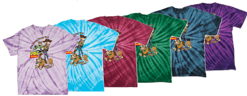
Unisex Short Sleeve Tie Dye - 100% Cotton Lavender, Turquoise, Maroon, Forest, Navy, Purple