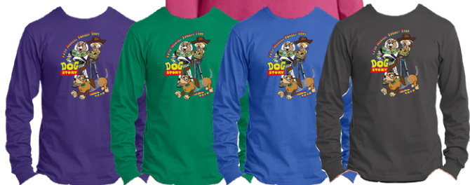
Long Sleeve - 100% Cotton Unisex & Ladies

Sangria (Ladies Only Pictured Above), (Unisex & Ladies) Purple, Kelly, Royal, Charcoal