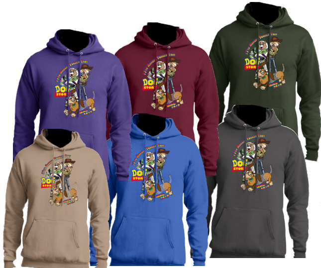
Unisex Hoodies - 100% Cotton Purple, Cardinal, Olive, Sand, Royal, Charcoal

Sangria (Ladies Only Pictured Above), (Unisex & Ladies) Purple, Kelly, Royal, Charcoal