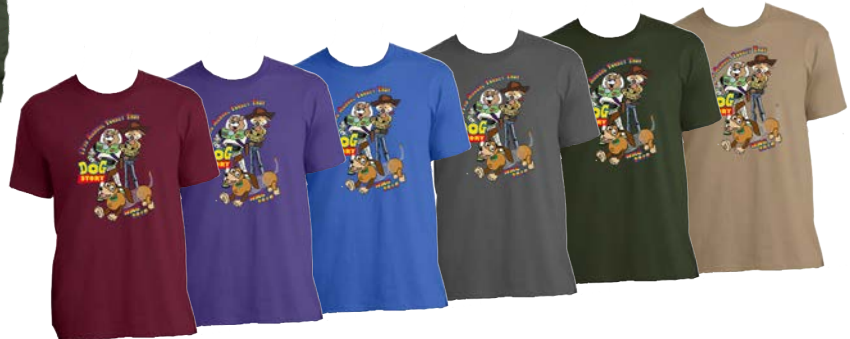
Unisex Short Sleeve Solid - 100% Cotton Cardinal, Purple, Royal, Charcoal, Olive, Sand